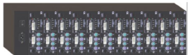
Dual transmitter - 10 module rack