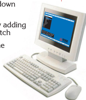
UltraMatrix Advanced Visual Interface

Local monitor connection, security, flash memory, system status, and a long list of other features ensures the UltraMatrix will streamline your data center or server room. Call us for more information on this and other excellent Rose products.