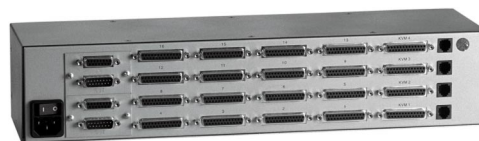
Rear view of UltraMatrix 4xE, model # EE4-4X16U/E2

ROSE ELECTRONICS - US HEADQUARTERS 10707 Stancliff Road ■ Houston, Texas 77099 ■ USA Tel 281-933-7673 ■ Tel 800-333-9343 ■ Fax 281-933-0044